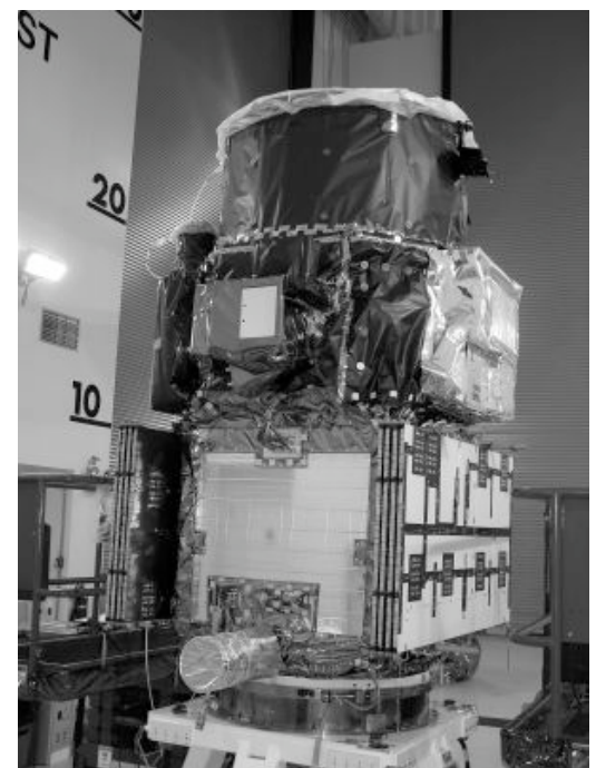
Fig. 1. The CALIPSO satellite.

CALIPSO will carry the first polarization lidar in orbit, along with infra red and visible passive imagers, and will fly in formation as part of the Afternoon Constellation (A-train). The acquisition of observations which are simultaneous and coincident with observations from other instruments of the A-train will allow numerous synergies to be realized from combining CALIPSO observations with observations from other platforms. In particular, cloud observations from the CALIPSO lidar and the CloudSat radar will complement each other, together encompassing the variety of clouds found in the atmosphere, from thin cirrus to deep convective clouds. CALIPSO has been developed within the framework of a collaboration between NASA and CNES and is currently scheduled to launch, along with the CloudSat satellite, in spring 2006. This paper will present an overview of the CALIPSO mission, including initial results.